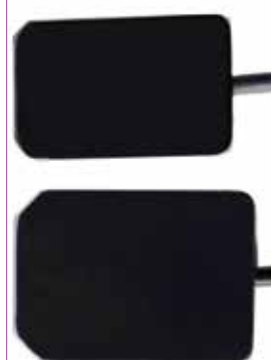
Reliable and durable, available in two sizes.

Bluetooth 2 is the widely adopted wireless communication technology that allows for fast image transfer to your PC only, truly respecting patient privacy. The MyRay patented interference-free implementation makes it even more reliable and safe.