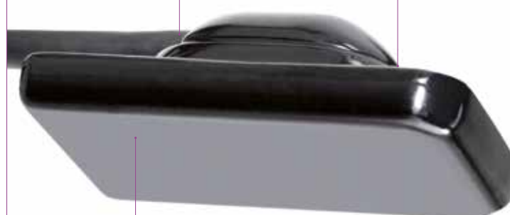
Hardened outer casing.

Reinforced cable attachment on sensor back. Sealed and liquid proof.