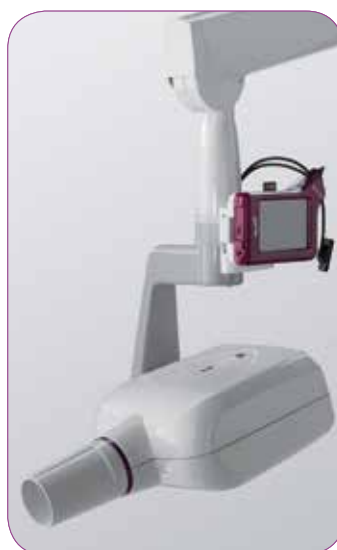
Smart Holster available, attach the X-pod to any surface.